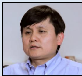
Dr. Wenhong Zhang Huashan Hospital affiliated with Fudan University

"It is still a long way to control this disease. I may not succeed for my lifetime, but I hope the younger generation would carry forward this course to control the disease."